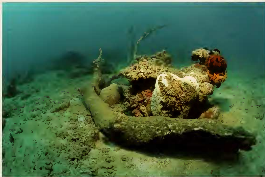
Figure 9. Tree debris on the reef at 5 m water depth; north coast of Aceh Province, October 27, 2005.

The reef was characterised by 31% rock and equal proportions of live coral cover and rubble (21% each). Moving further east, the final survey in this area displayed minimal signs of tsunami damage. Although one tree branch was observed on the reef, no coral had been killed, broken or overturned and the reef displayed large stands of healthy blue coral Heliopora coerulea (Fig. 10) and Porites spp. Live coral cover accounted for 35% of the substrate.